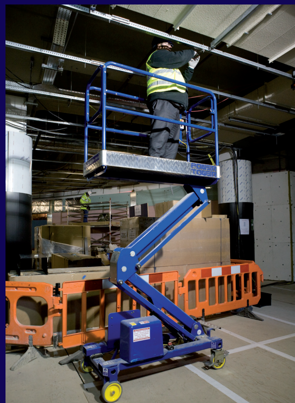
Passes easily through single doorway or into passenger lifts.