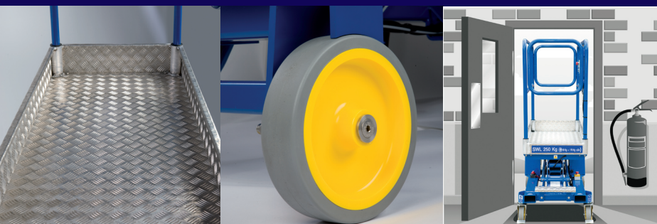
Non-slip, non-corrosion decking